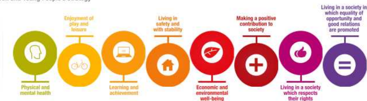
Children and Young People’s strategy

The Strategy for Children and Young People 2019-2029 is the overarching strategy in Northern Ireland from which flows a variety of cross-departmental, multi-agency plans, topic-specific strategies and programmes. 6 It states the well-being of children and young people includes: